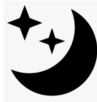
in the evening