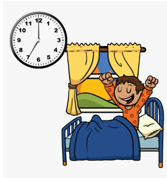
in the morning